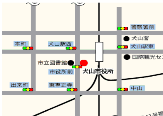
The Location of the City Hall