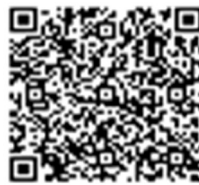
For Android OS

If you have any questions about how to dispose of the garbage, please call